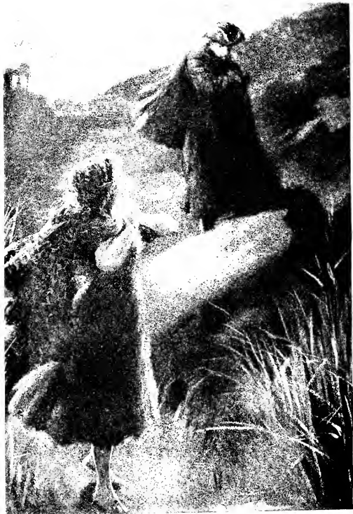
11111 "A figure rose suddenly up."